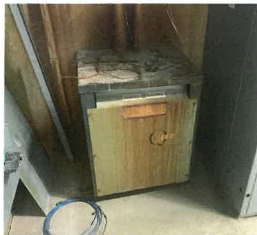
Secondary Transformer in heat plant. Water damage is visible.