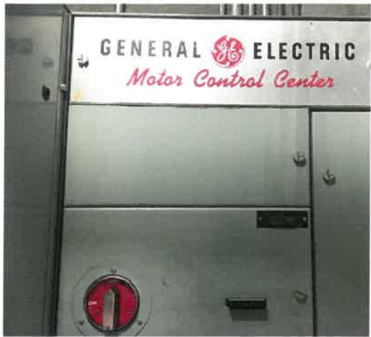
Close-up of Motor Control Center label and existing feeder switch.