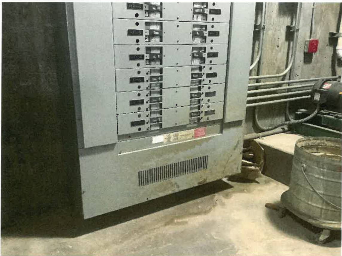
Secondary breakers with visible water contact.